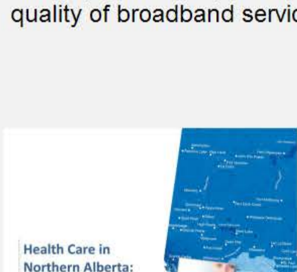
Update Northern Health