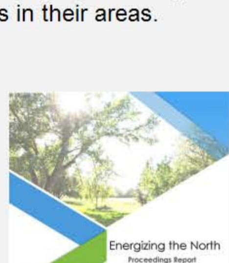
Alternative & Renewable Energy